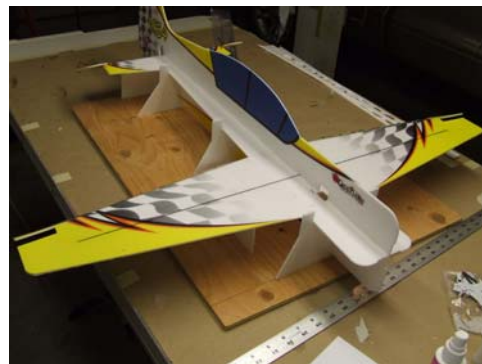
Everything is square