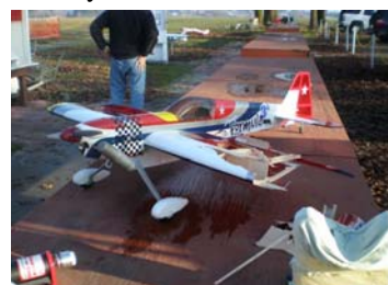
Fly-A-Ways in February, it's just to BRIGHT