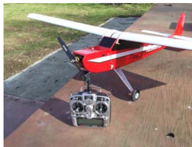
Telemaster Electric 73 inch AXI-2826-12, Jetti-40 amp controller, A123 4 cell 2300 mAh battery, AR7000 RX, JR X9303 TX