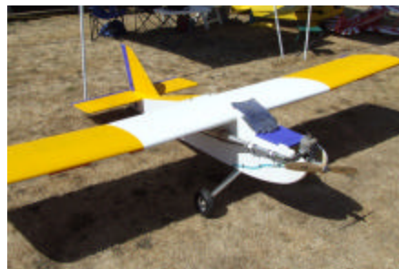
SFK, Span 134', Cord 25", Length 95", Weight 40 lb Power ZDZ60RV, Tuned Pipe, Smoke Module.

Two noticeable missing items in the DX7 system are throttle exponential and no failsafe available for channels five through seven. I need to try throttle to throttle mix to see if I can make the throttle think it has a nonlinear curve. In the event of transmitter failure if you bind the throttle at idle cutoff with the throttle trim down the engine will shut down in the event of transmitter failure in place of ignition cutoff.